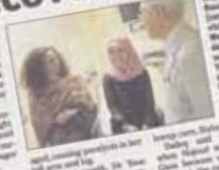
The young girl, who was injured during a conflict in Gaza, is now recovering well and is expected to return home soon.

She underwent brain surgery to repair her partial paralysis, which had lasted for two years. The surgery was performed by a team of experts and was a significant step towards her recovery. The girl is now happy and healthy, and is a testament to the power of love and support.