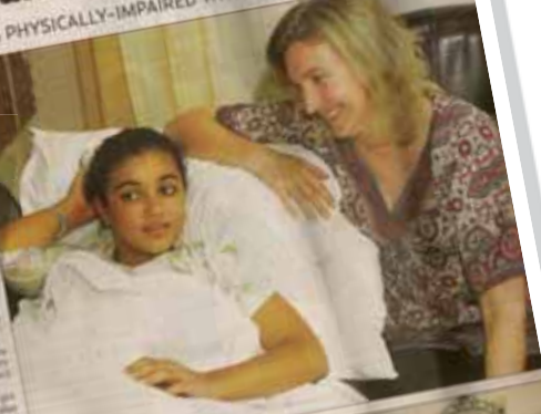
New lease of life. A 12-year-old boy from Gaza smiles a light moment with the team of doctors who flew to Dubai to help him.