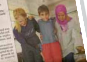
Children from Gaza.